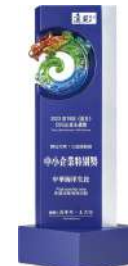
2023 Global Views-ESG Sustainability Awards