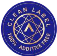
2021 Anti Additive (A.A.) Clean Label